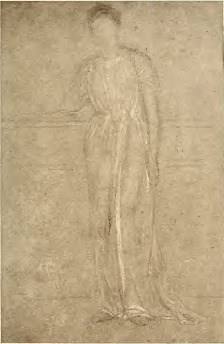
DRAPED FIGURE STANDING. (Pastel.)